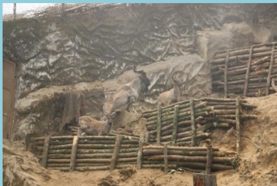
Soil Retention in Markhor Enclosure

Due to soil erosion in the enclosures of Himalayan Tahr, Markhor and Yak soil retention work was done. Wooden log barricades were done at the hilly terrain of the enclosures. A barricade was also placed in and around the large trees of the enclosures.