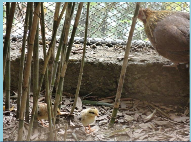
Red Jungle Fowl ( Gallus gallus ) and Chicks