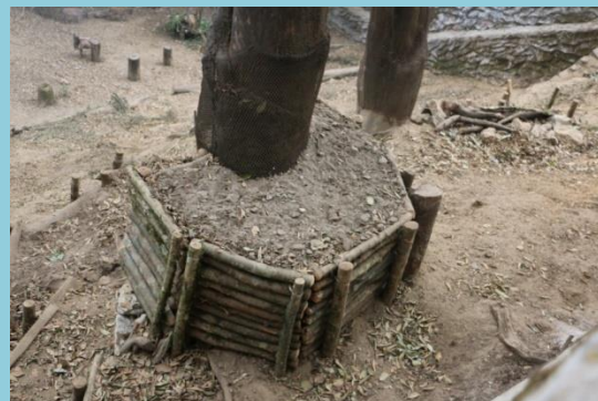
Soil Retention in Markhor enclosure