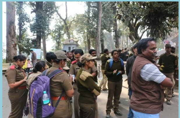
Educational Tour of Telangana State Forest Academy