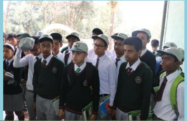
Educational Tour of Nabil's Memorial School, Sikkim