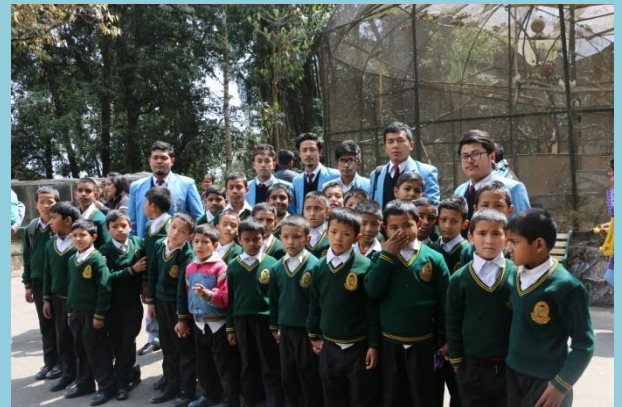
Educational Tour of Municipal Primary School, Darjeeling