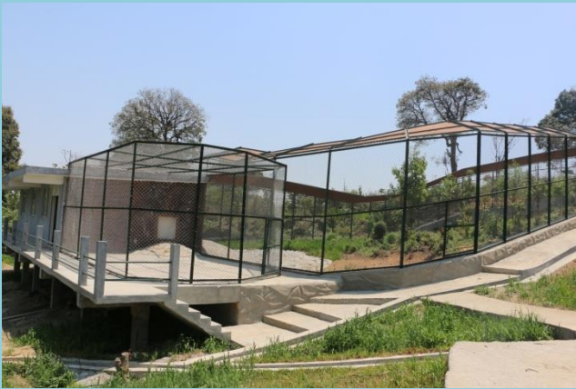
New Snow Leopard Open Enclosure

Two open top carnivore enclosures were constructed with a total area of 680 sq m each. Including the night shelters. Similarly two open topped red panda enclosures were constructed to provide more space for new born. While enrichment works have already been completed in the red panda enclosures construction of caves and other form of enrichment needs to be done in the snow leopard enclosures.