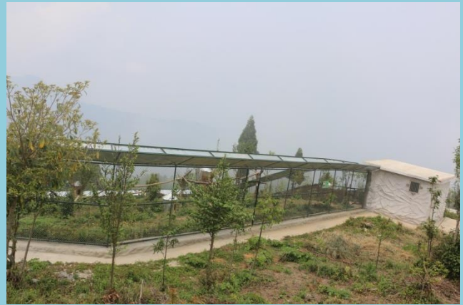
New Red Panda Open Enclosure