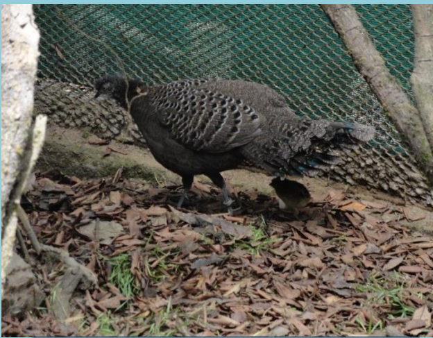
Grey Peacock Pheasant and Chicks